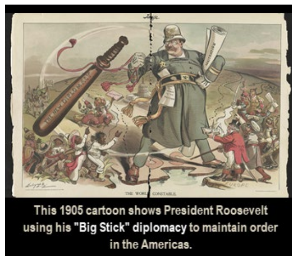
This 1905 cartoon shows President Roosevelt using his "Big Stick" diplomacy to maintain order in the Americas.