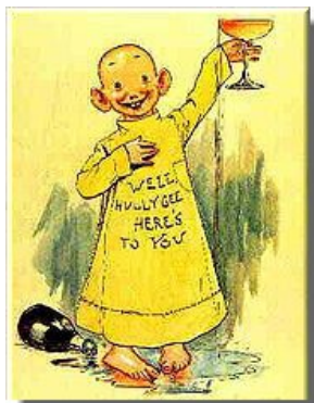
"The Yellow Kid", a newspaper cartoon character, gave its name to the sensational journalism of the time.